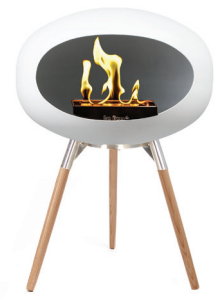
Le Feu Ground Low White £1,599.00