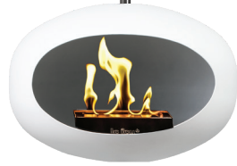
Le Feu Sky White £1,599.00