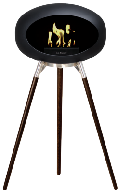
Le Feu Wood White £1,499.00