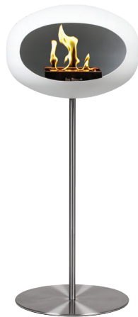
Le Feu Steel White £1,599.00