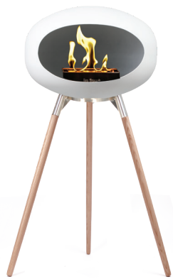
Le Feu Wood £1,599.00