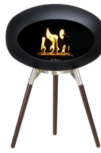
Le Feu Ground Low £1,499.00