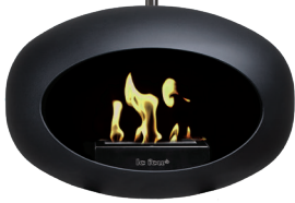
Le Feu Wall £1,499.00