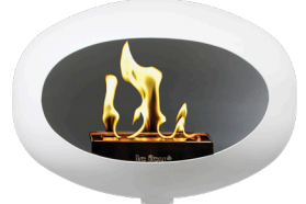
Le Feu Wall White £1,599.00