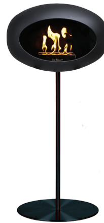
Le Feu Steel £1,499.00