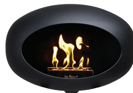
Le Feu Wall £1,499.00