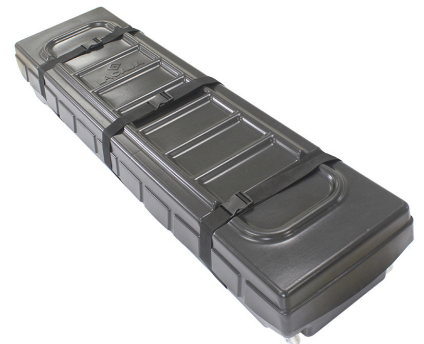
La Caja Case