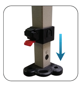
Step 8 The install is complete.