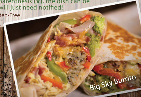
Big Sky Burrito

*Consuming raw or undercooked meats, poultry, seafood, shellfish, or eggs may increase your risk of foodborne illness