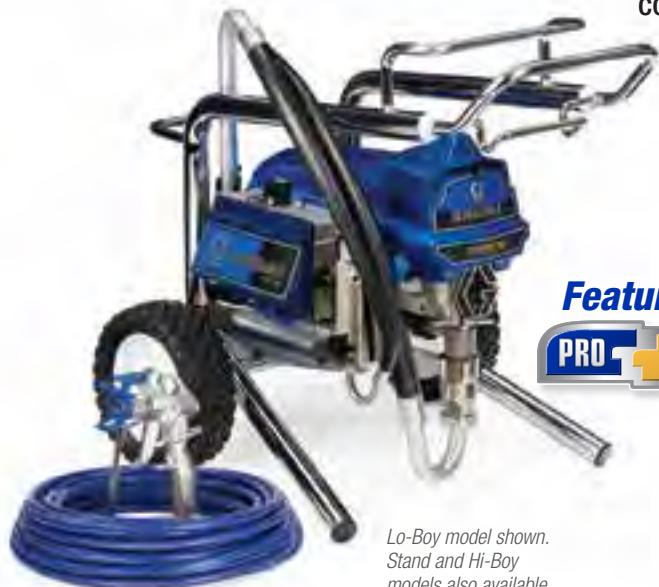
Lo-Boy model shown. Stand and Hi-Boy models also available.

The Ultra Max II 495 PC Pro brings the leading technology and performance of Graco's larger Ultra Max II models into a compact and lightweight design.