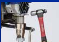
1) Loosen the clamping nut