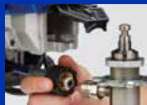
3) Remove hose and suction tube