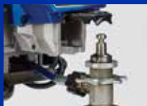
2) Open door and remove pump