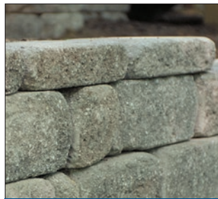
6. Capping the Wall

Place the shouldered fiberglass pins into the holes of the Units (note: place one pin only per each grouping of three holes). Place pins in the middle hole for near vertical alignment or the holes nearest the embankment for a 9.5° +/- batter per course. According to wall requirements and design, the front pin hole (towards the face of the wall) can be used randomly to allow a forward projection of a specific unit for accent and variation in the wall appearance.