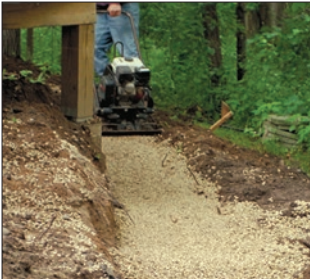
1. Prepare Base Leveling Pad

Remove all surface vegetation and debris. Do not use this material as backfill. After selecting the location and length of the wall, excavate the base trench to the designed width and depth (min. 20" w x 12" d). Start the leveling pad at the lowest elevation along wall alignment. Step up in 6" increments with the base as required at elevation changes in the foundation. Level the prepared base with 6" of well-compacted granular fill (gravel, road base, or 1/2" to 3/4" crushed stone). Compact to 95% Standard Proctor or greater. Do not use PEA GRAVEL or SAND for leveling pad.