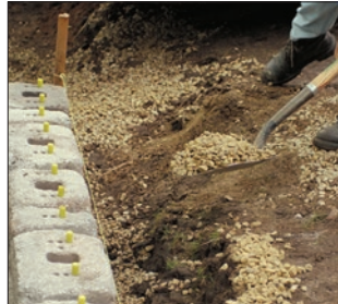
4. Install Fill & Compaction

Remove all surface vegetation and debris. Do not use this material as backfill. After selecting the location and length of the wall, excavate the base trench to the designed width and depth (min. 20" w x 12" d). Start the leveling pad at the lowest elevation along wall alignment. Step up in 6" increments with the base as required at elevation changes in the foundation. Level the prepared base with 6" of well-compacted granular fill (gravel, road base, or 1/2" to 3/4" crushed stone). Compact to 95% Standard Proctor or greater. Do not use PEA GRAVEL or SAND for leveling pad.