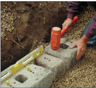
2. Install the Base Course

Once the pins have been installed, provide 1/2"-3/4" crushed stone drainage fill behind the units to a minimum depth of 12". Fill open spaces between units and open cavities/cores with the same drainage material. Proceed to place backfill in maximum 6" layers (lifts) and compact to 95% Standard Proctor with the appropriate compaction equipment. Do not use heavy ride-on compaction equipment within 3' from back of wall. Do not use jumping or ramming type compaction.