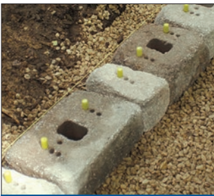
3. Insert Fiberglass Pins

Place the next course of units over the fiberglass pins, fitting the pins into the long receiving channel recess of the units above (Note: Some removal of debris in the pin holes and channel may be necessary prior to placement). Push the units toward the face of the wall until they make full contact with the pins. If pins do not connect with channel but align in open core of upper unit, place drainage fill in core to provide unit interlock with pin. For near vertical alignment, center the unit above over the center placed pins below.