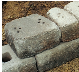
5. Install Additional Courses

Place the first course of units end to end (with front corners touching) on the prepared base. The long groove (receiving channel) on the unit should be placed down and the three pin holes should face up, as shown. Make sure each unit is level - side to side and front to back. Leveling the first course is critical for accurate and acceptable results. For alignment of straight walls, use a string line aligned on the unit pin holes for accuracy. Minimum embedment of base course is 6" below grade.