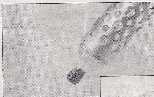
LSV Water Pipe Adapter