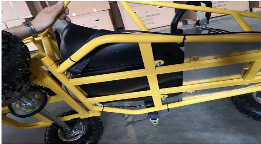
11. Install the oil tank.