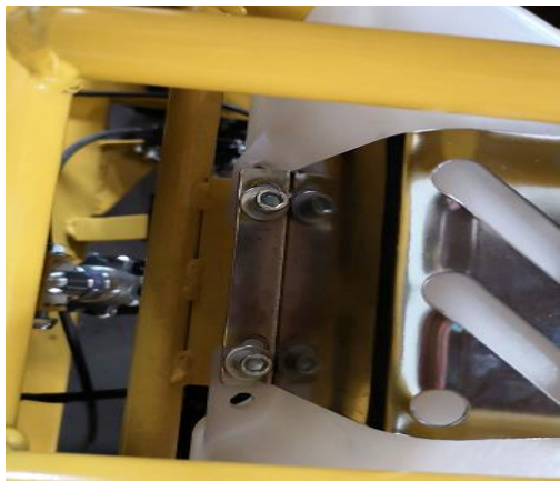
12. Install gas pipe&Inlet pipe