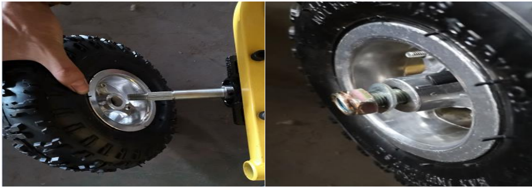
6. Install the steering wheel.