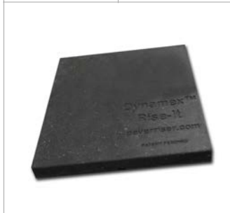
Flat (no spacer tabs)