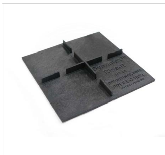
Flat with tabs