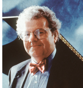
Ax plays Beethoven

What's been the Broadway musical that's driven the most fandom since "Hamilton"? That would be "Dear Evan Hansen," a story about a boy with crippling anxiety who forms an unlikely relationship with a grieving family because of a lie. Bring the tissues — this is a tearjerking, but ultimately heartwarming affair.