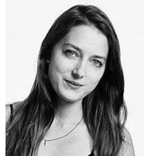
'Baby Screams Miracle'