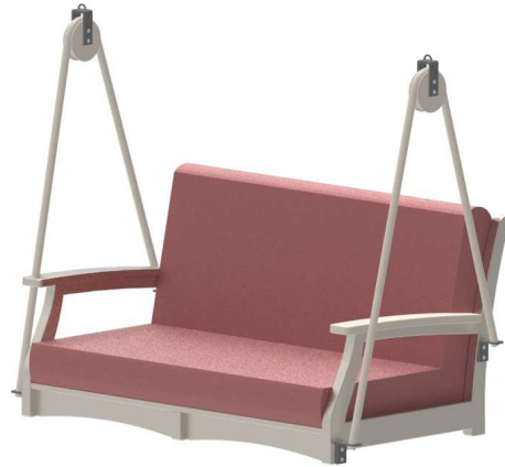
Love Seat Swing