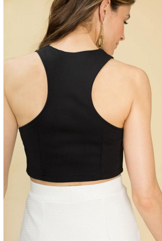
ITALIAN SCUBA | CROP TOP | HALTER | ONYX | SRP: $165