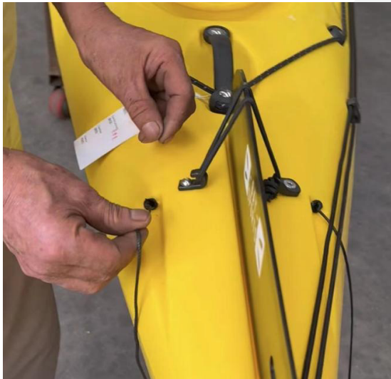
4 Thread a string through the tube into the kayak hull.