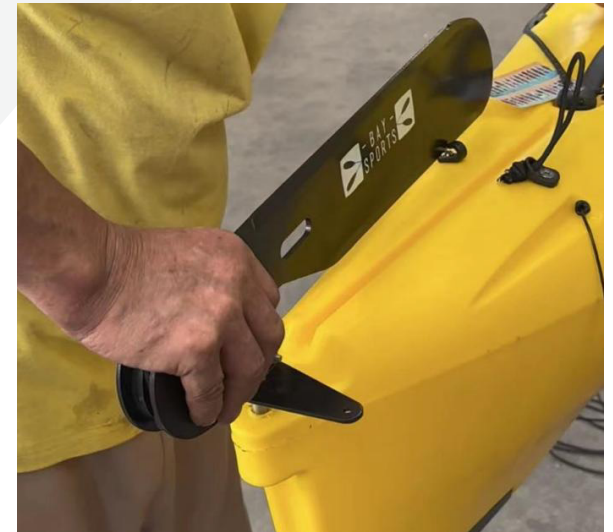
6 Insert the rudder.