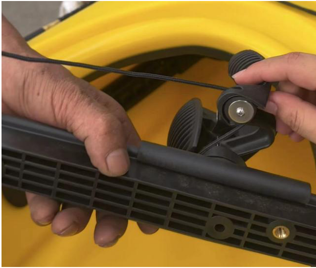
1 Thread the rope around the footrest.