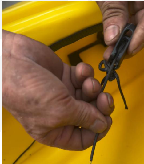
5 Secure both ends of the string with black plastic and connect to the footrest.