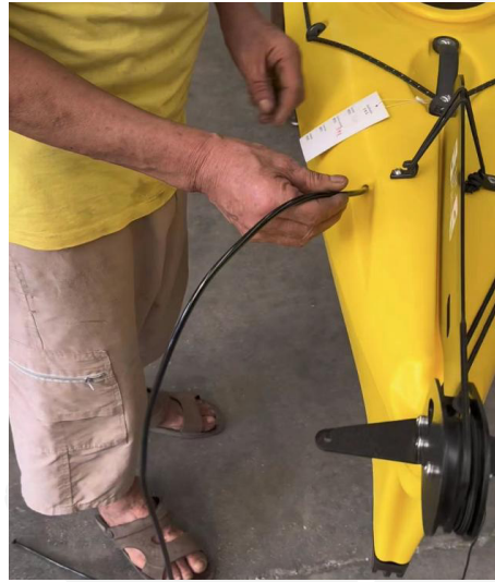
2 Thread the tube into the tail of the kayak hull.