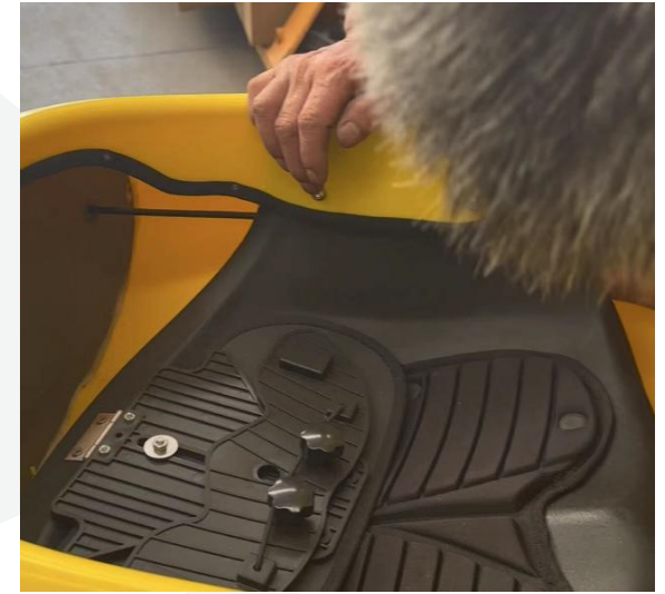
3 Run through the cockpit.