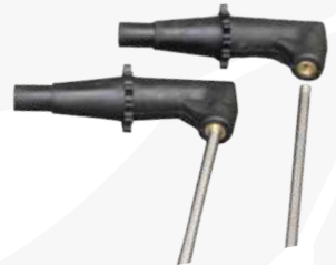
042 SPROCKET SHAFT 043 SET SCREW