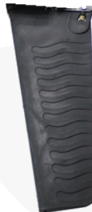
061 STANDARD FIN