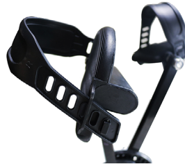
01 PEDAL PAD KIT