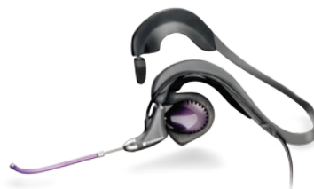
H171 DuoPro Voice Tube model, shown with accessory neckband for behind-the-head wearing. Neckband is sold separately.

DuoPro headsets require a Plantronics audio processor, USB audio processor, or direct connect cable to connect to phone or PC.