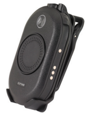
Swivel Belt Holster