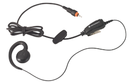
Earpiece with inline PTT button

This revolutionary, clean design provides rapid charging of your Motorola CLP. A Multi-unit charger allows you to conveniently charge up to six Motorola CLPs simultaneously. The charger is designed with a back pocket to store your earpiece while the unit is charging, and can be mounted on the wall if space is at a premium.