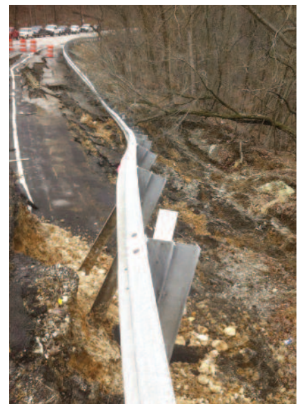
View of slide and road damage from the north.