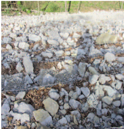
View from top of structure showing rip rap filled units.

The roadway has been re-opened for over a year now without any issues as the design and products have achieved the goals MODOT set out to achieve on this project, which were to reopen the road in the quickest and most economical way.