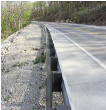
View from south of repaired road and slide.