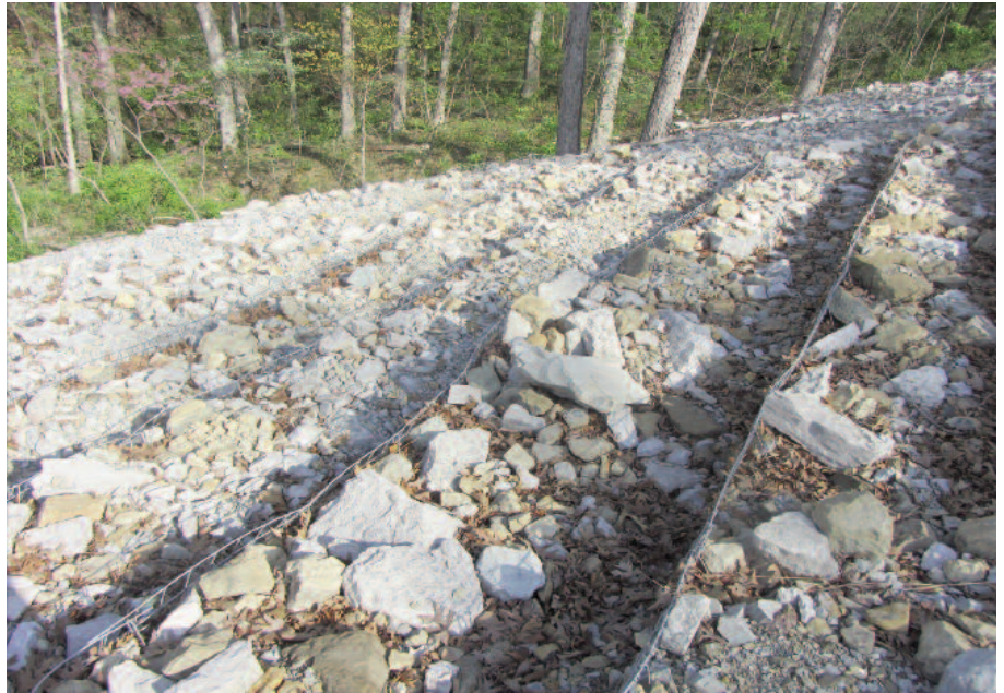
View from top of structure showing rip rap filled units.