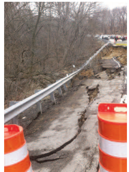
View of slide and road damage from the south.

With the use of the high strength flexible uniaxial geogrids combined with a non-woven geosynthetic, construction proceeded in a rapid sequence and the contractor was able to reopen the road ahead of schedule, exceeding the expectations of local residents and the Missouri DOT.