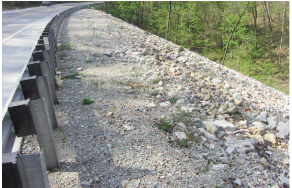
View from north of repaired road and slide.

TenCate® Geosynthetics Americas assumes no liability for the accuracy or completeness of this information or for the ultimate use by the purchaser. TenCate® Geosynthetics Americas disclaims any and all express, implied, or statutory standards, warranties or guarantees, including without limitation any implied warranty as to merchantability or fitness for a particular purpose or arising from a course of dealing or usage of trade as to any equipment, materials, or information furnished herewith. This document should not be construed as engineering advice.