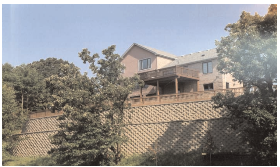
Miragrid® 7XT was used to reinforce this Keystone® retaining wall.

All parties involved were completely satisfied with the design, construction and final result of the project. the replacement of the timber wall and the adjacent slope with the Keystone wall has created a very impressive and aesthetically pleasing structure along the parkland.