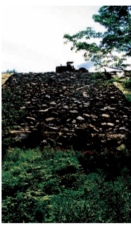
Facing of slope using onsite rip rap and vegetation.

By utilizing a reinforced soil slope over the steel piles, the contractor was able to construct a support pad for the bridge abutment. The contractor was able to construct this support pad using minimal equipment and labor and in a timely fashion thus creating considerable cost savings for the state.