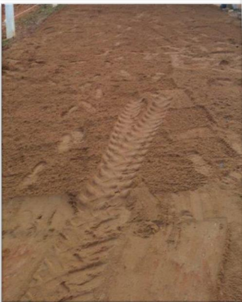
Before: Muddy mess