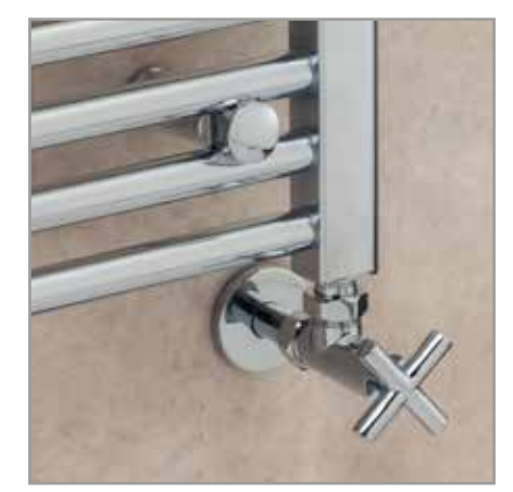
ARGYLL shown with LIVINGSTONE Valves.