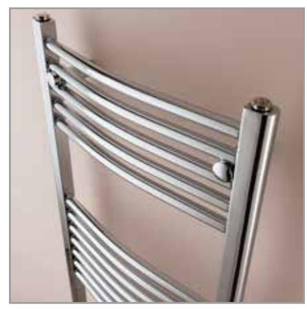
ARGYLL Curved option.