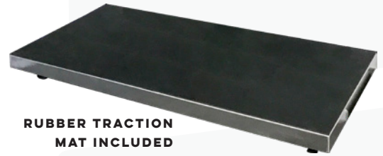
RUBBER TRACTION MAT INCLUDED