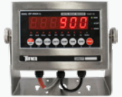
OP-900 STAINLESS STEEL