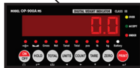
Easy to use OP-900 indicator with 0.9" LED display