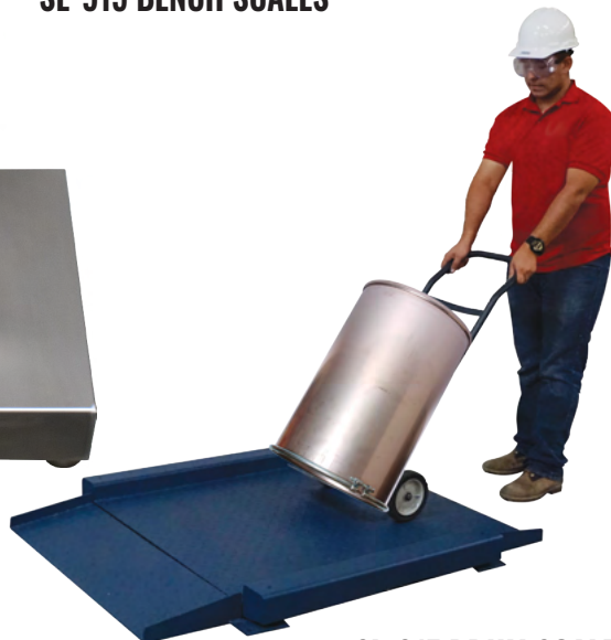
SL-917 DRUM SCALES