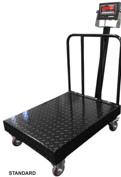
STANDARD DIAMOND PLATE