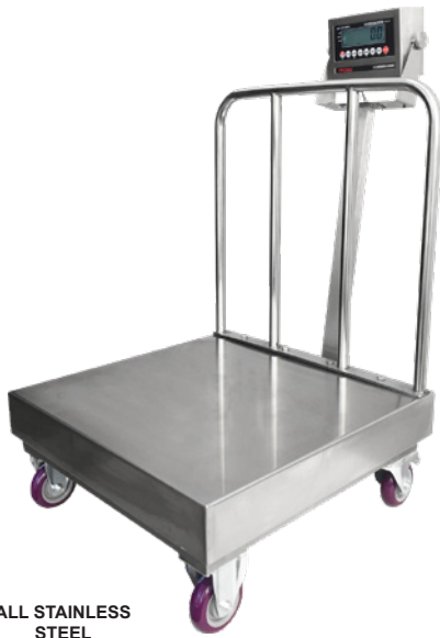
ALL STAINLESS STEEL