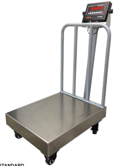
STANDARD WITH SS COVER