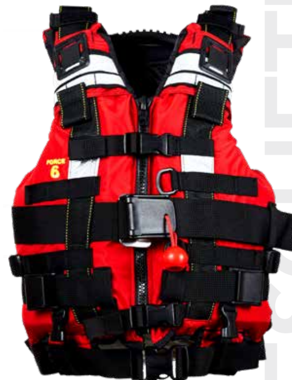
S/M Red #P200 L/XL Red #P201

ACCESSORIES: Extrication leash, swim harness, front and back pockets, see accessories