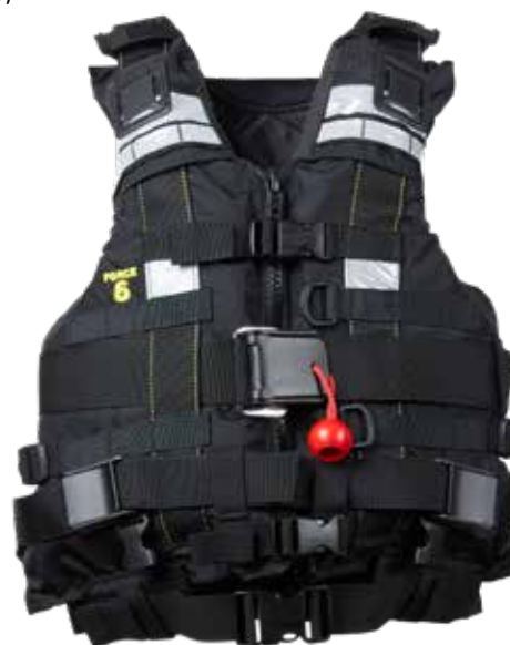
S/M Black #P100 L/XL Black #P101