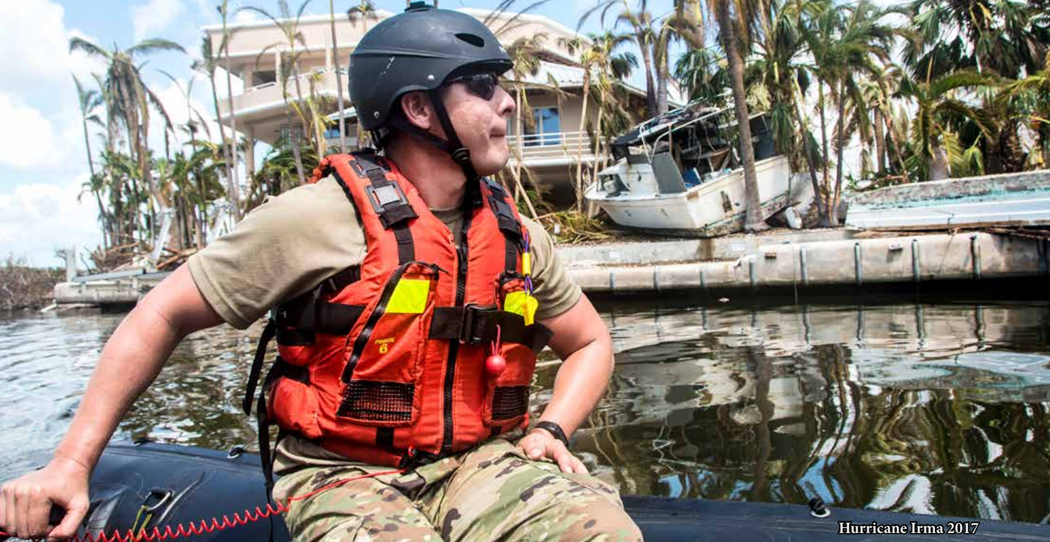
Hurricane Irma 2017