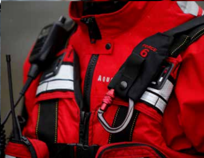
Texas Parks & Wildlife Colorado River (Lampasas County) 2018