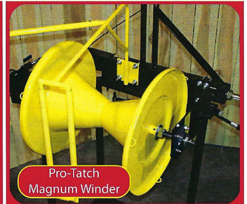
Pro-Tatch Magnum Winder