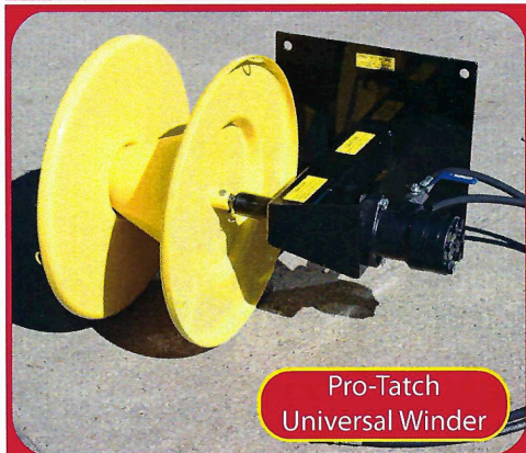
Pro-Tatch Universal Winder

Note: Any reel we manufacture will work on this high tensile wire winder. Includes yellow split reel. 8 in. solid, 4 in. solid and mini reel.