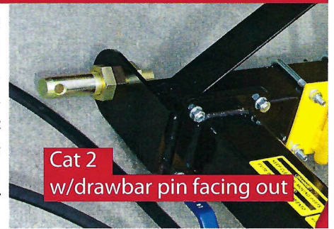
Cat 2 w/drawbar pin facing out

The Pro-Tatch hydraulic wire winder is made in the U.S.A. with all steel construction and designed to be used for barbed or smooth wire. This winder is shown with the high tensile reel. Our winders have also been used to roll cable & hose in other applications. If you have both the Cat1 (7/8") and Cat2 (1-1/8") pins as shown in the photos, it is very easy to convert the Winder from Cat1 to Cat2 mount and back again.