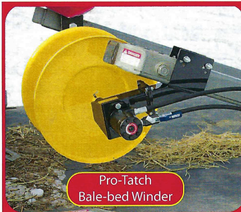
Pro-Tatch Bale-bed Winder