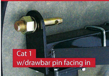
Cat 1 w/drawbar pin facing in

This reel can also be used like a Spinning Jenny to unroll new rolls of wire or rolls that have been previously rolled up on this reel