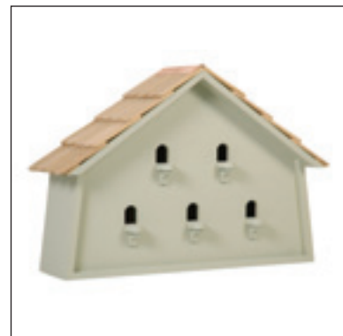
Top to bottom, left to right - Taylor of old Bond St Grooming Box in brown leather - Selfridges £229 Tel: 0800 123 40 www.Selfridges.com Cap - Tweedies Originals £54 Tel: 02071932411 www.tweediesoriginals.co.uk Wymington Briefcase in Sundance Floodlight Leather - Tusting £395 Tel: 01234 712266 www.tusting.co.uk Yes Deer Mug - Rawxclusive £9 Tel: 0560 368 8932 www.rawxclusive.com Coat Rack Single - Nick Fraser £78 Tel: 07737 367 419 www.nickfraser.co.uk Heritage Seed Collection - Sparrow and Finch £12.95 Tel: 01892 861202 www.sparrowandfinch.co.uk Shoe Loo Roll Holder - White Dove and Wonder £45 Tel: 07899 665197 www.whitedoveandwonder.co.uk World Map Print - Lane £109 (framed) www.lanebypost.com Four Seasons Bird House - Sparrow and Finch £99 Tel: 01892 861202 www.sparrowandfinch.co.uk