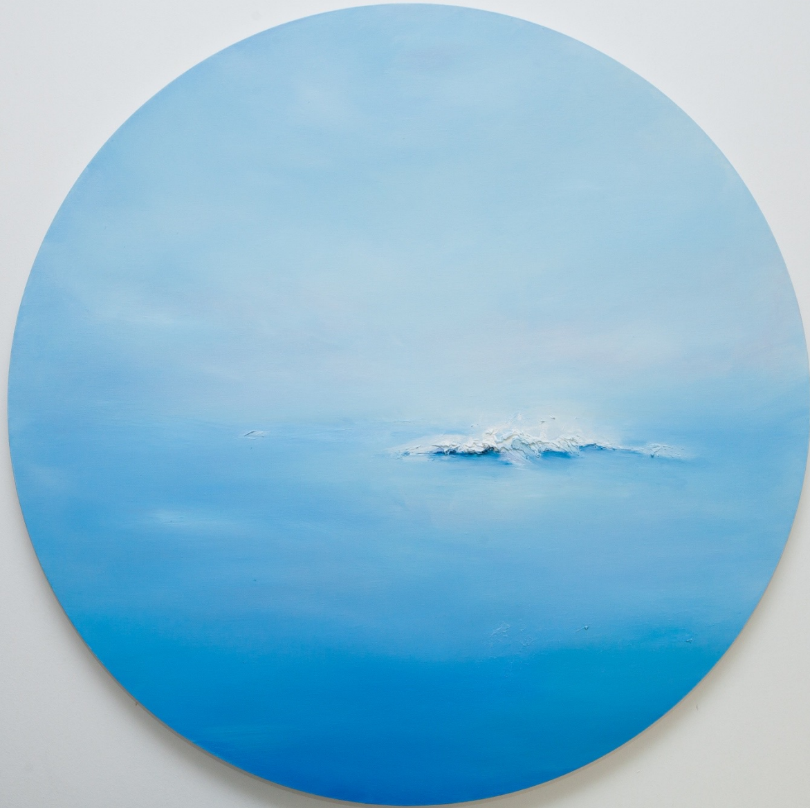
Yin Chua Serenity 80cm Oil on canvas 2023 SGD 2450