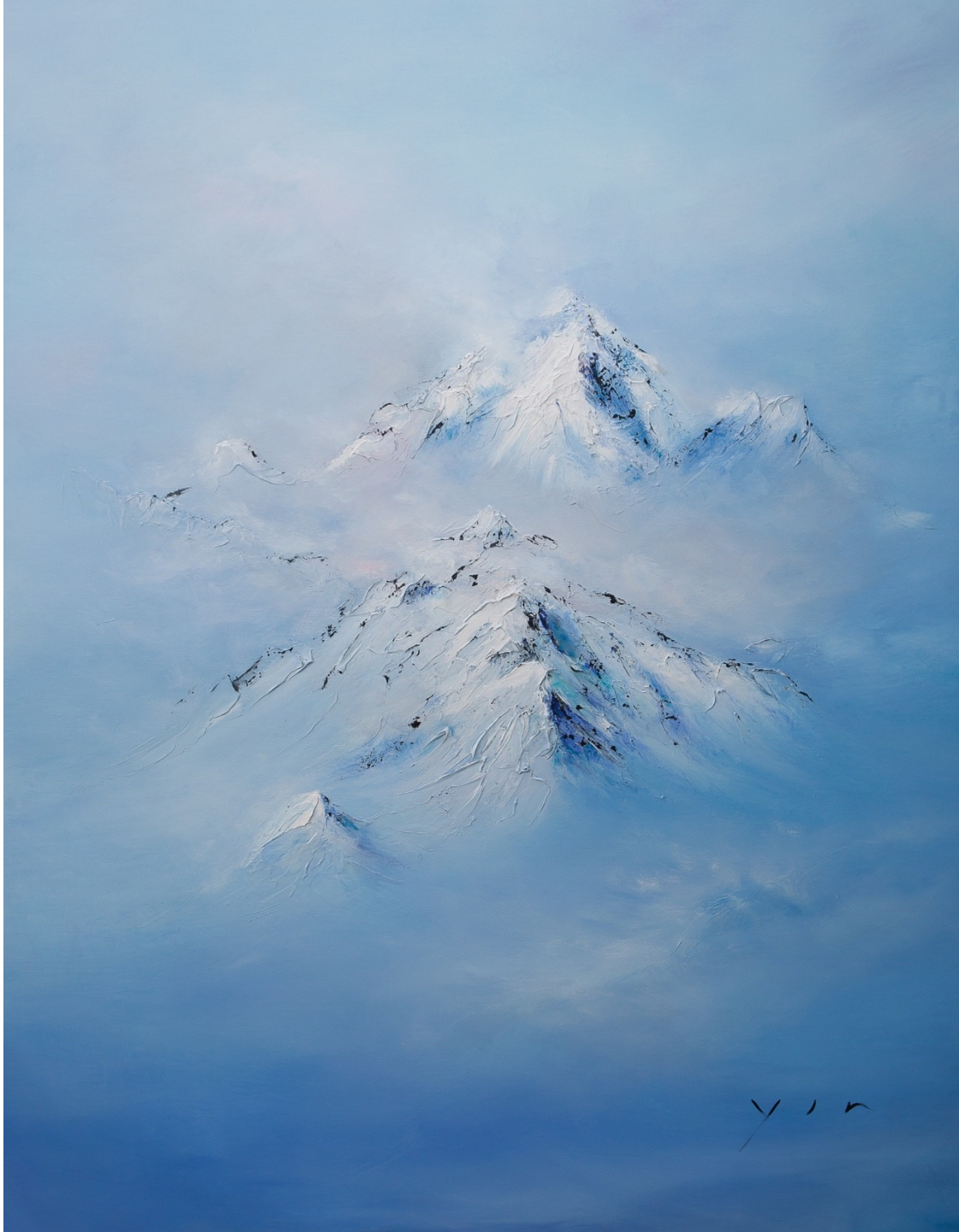
Yin Chua One step at a time 152 x 122cm Acrylic on canvas 2023 SGD 6800