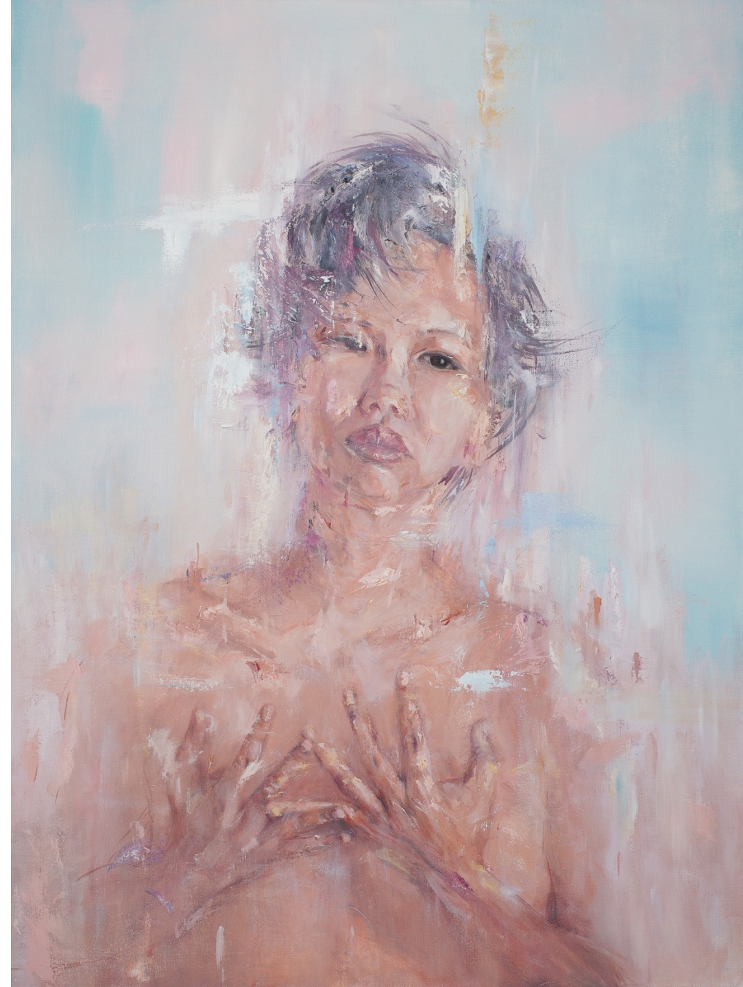
Yin Chua I am Enough 76 x 102cm Oil on canvas 2018 SGD 3650