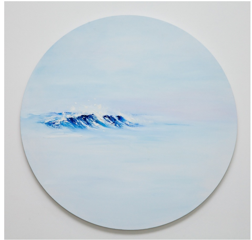
Yin Chua Calming waves 02 60cm Oil on canvas 2022 SGD 1850