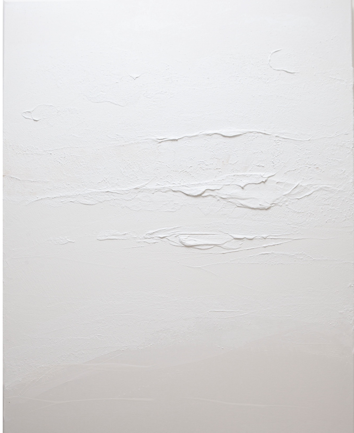
Yin Chua Making Space 102 x 76cm Mixed Media on canvas 2023 SGD 3950