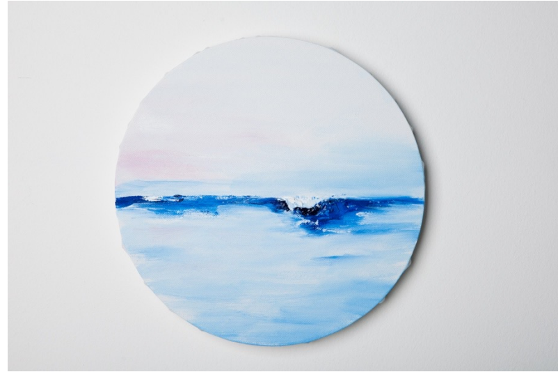
Yin Chua Calming waves 06 20cm Oil on canvas 2022 SGD 480