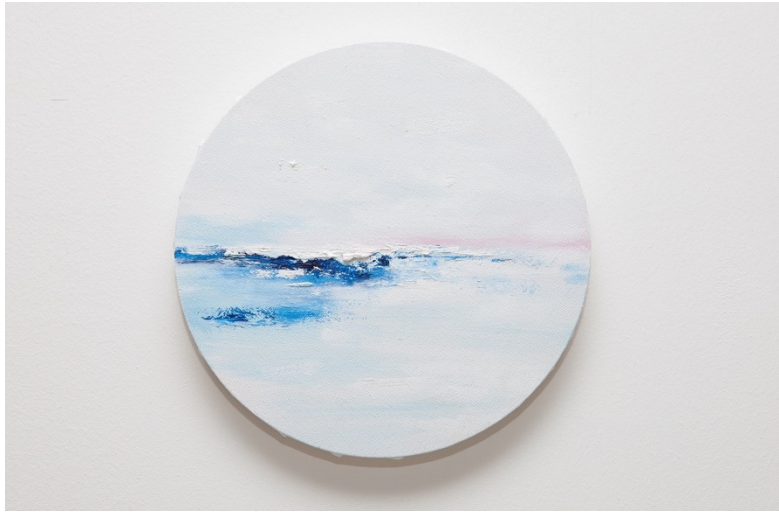
Yin Chua Calming waves 05 20cm Oil on canvas 2022 SGD 480