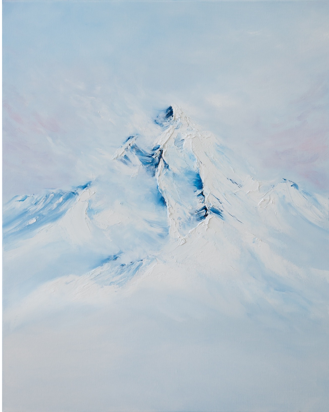
Yin Chua Serenity Peak 71 x 61cm Oil on canvas 2023 SGD 2070