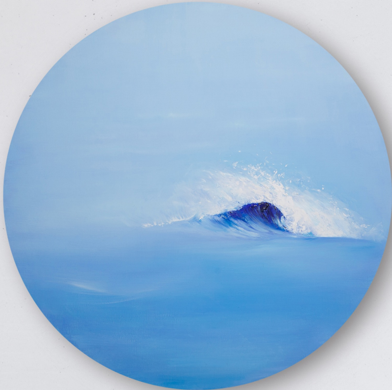
Yin Chua Calming waves 11 80cm Oil on canvas 2022 SGD 2450