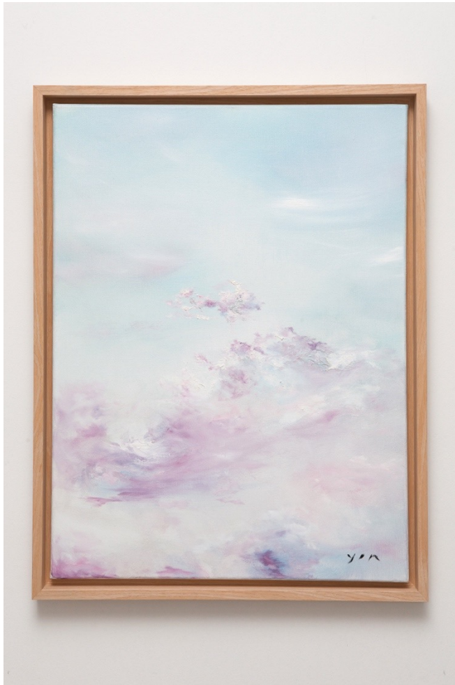
Yin Chua Sky blossoms 46 x 61cm Oil on canvas 2020 SGD 1450