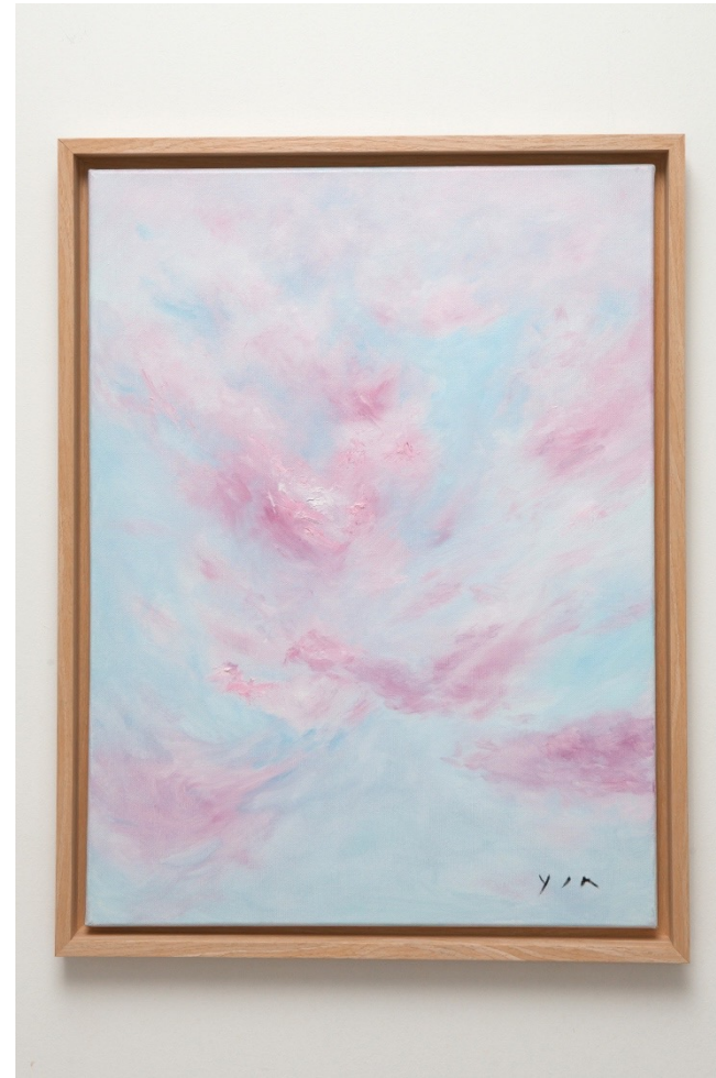
Yin Chua Sky blossoms 02 46 x 61cm Oil on canvas 2020 SGD 1450