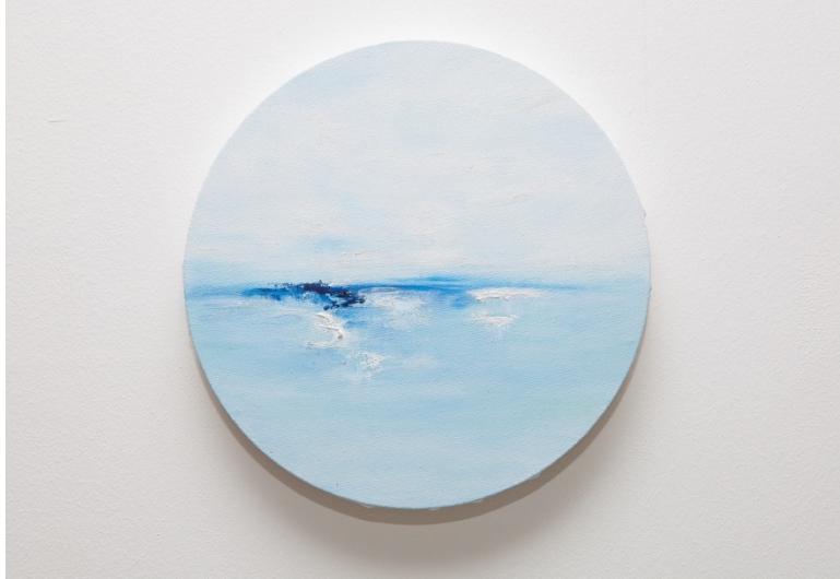
Yin Chua Calming waves 07 20cm Oil on canvas 2022 SGD 480