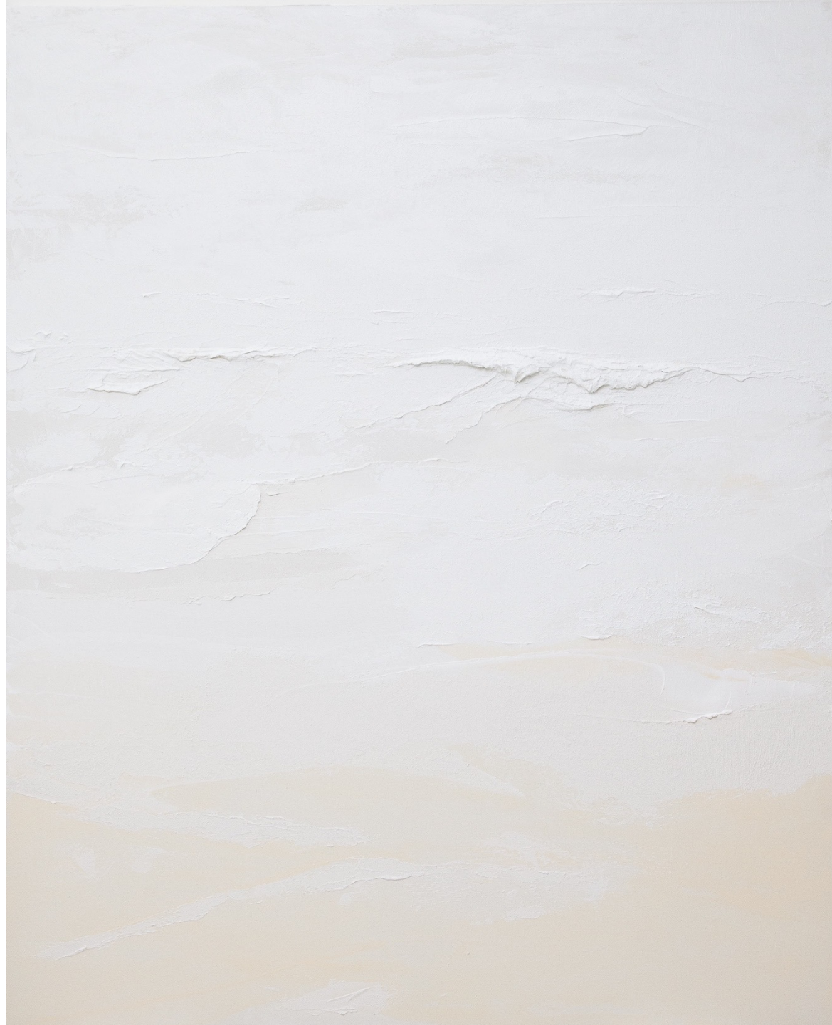
Yin Chua Equanimity 152 x 122cm Mixed Media on canvas 2023 SGD 6800