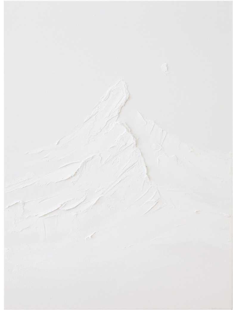
Yin Chua Solitude's Embrace 61 x 46cm Oil on canvas 2023 SGD 1250