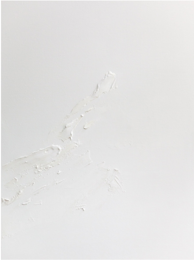
Yin Chua Insight 61 x 46cm Oil on canvas 2023 SGD 1250