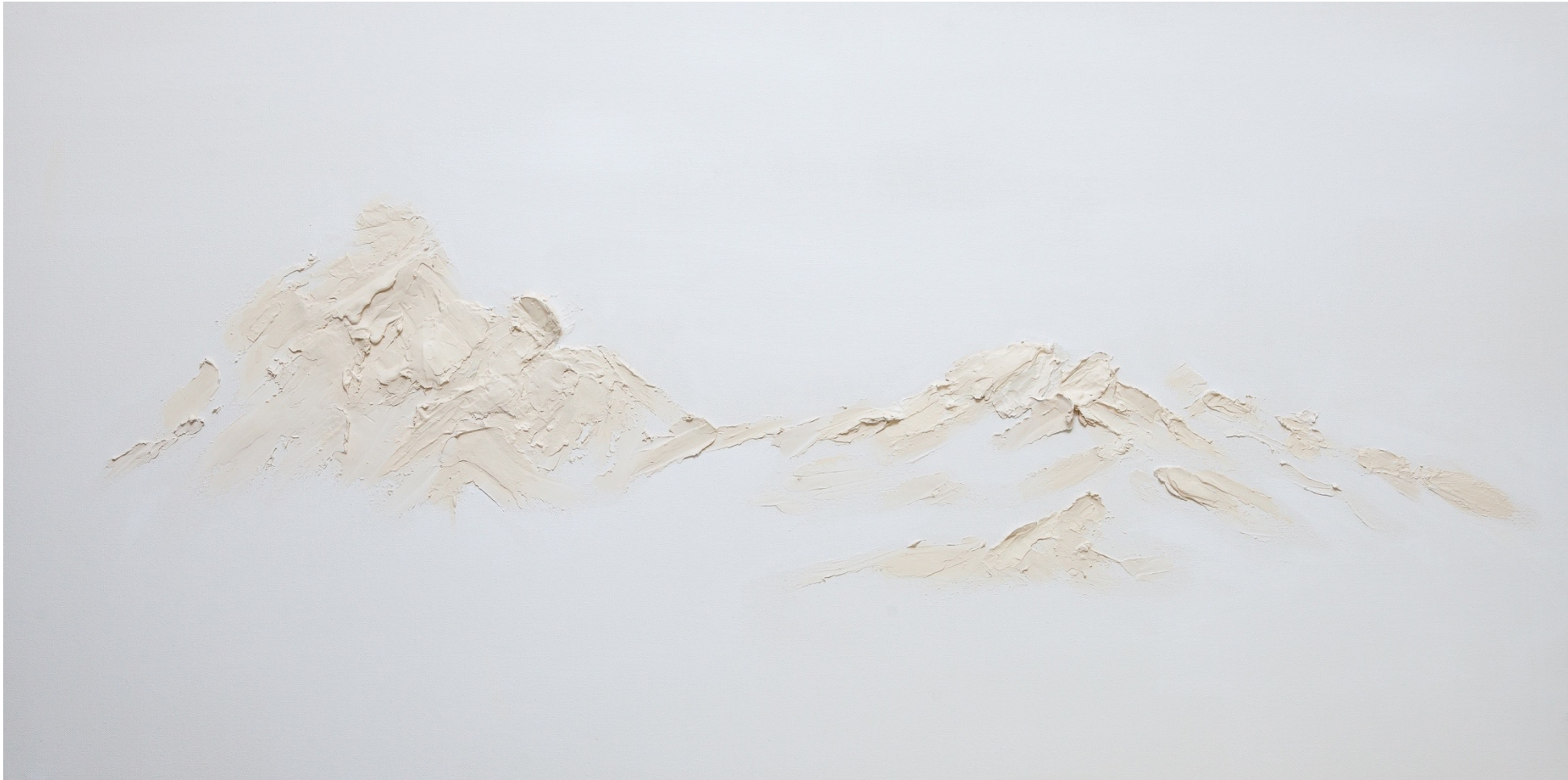
Yin Chua Sabi 61 x 122cm Mixed Media on canvas 2023 SGD 3950