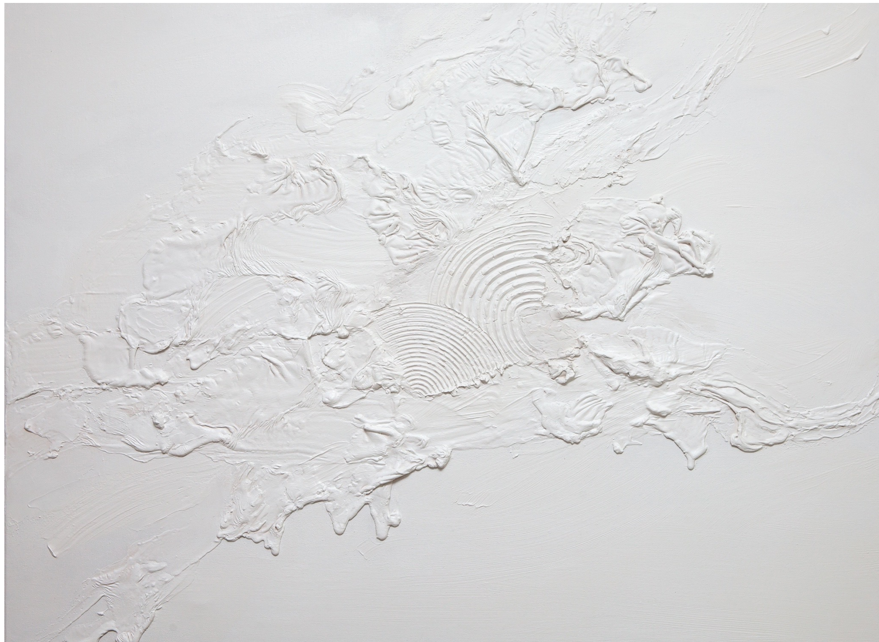
Yin Chua Breakfree 76 x 102cm Oil on canvas 2023 SGD 3650