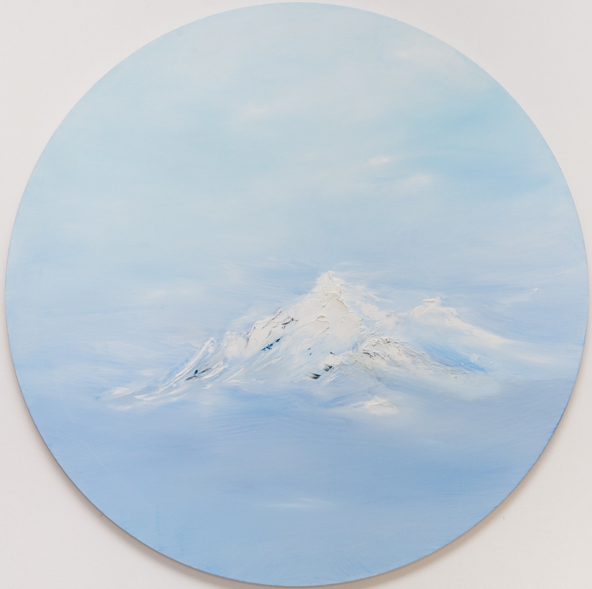
Yin Chua Snow Mountain 80cm Oil on canvas 2023 SGD 2450