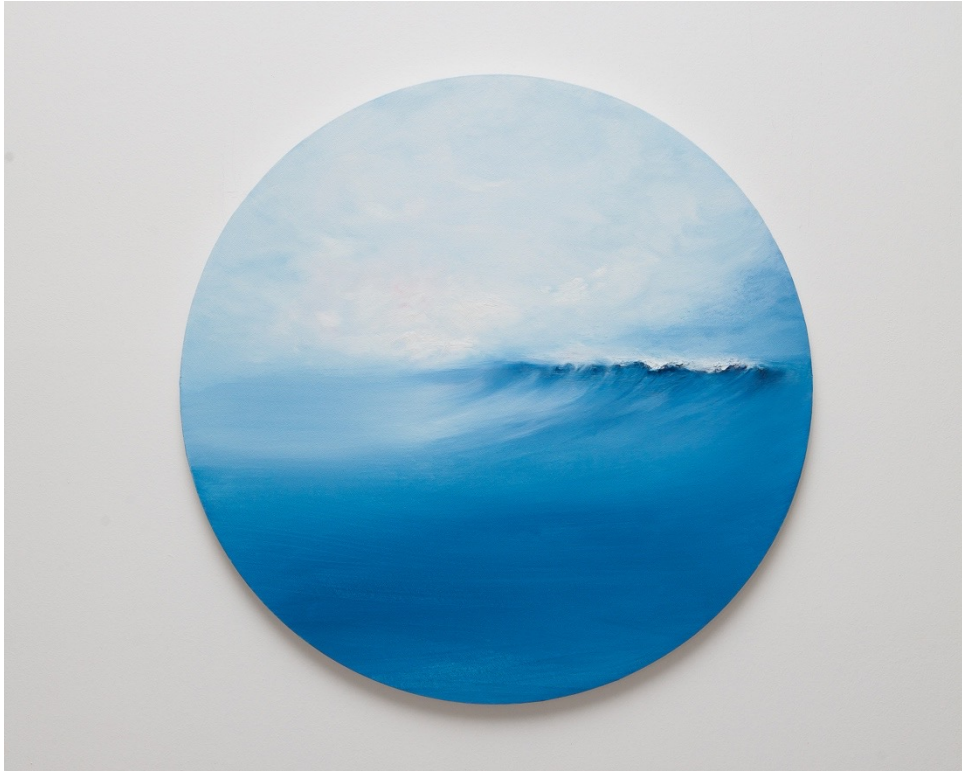
Yin Chua Calming waves 03 50cm Oil on canvas 2022 SGD 1600