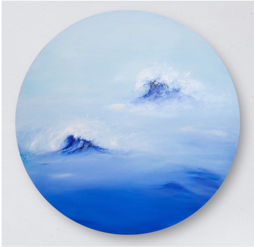
Yin Chua Calming waves 10 60cm Oil on canvas 2022 SGD 1850