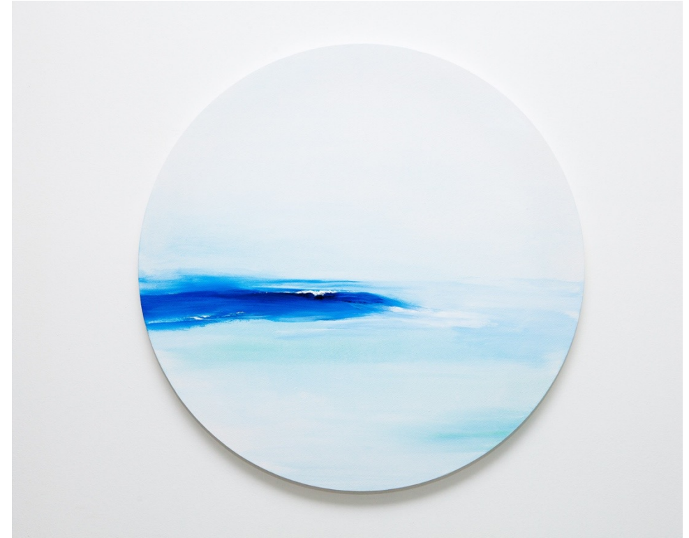
Yin Chua Calming waves 04 50cm Oil on canvas 2022 SGD 1600