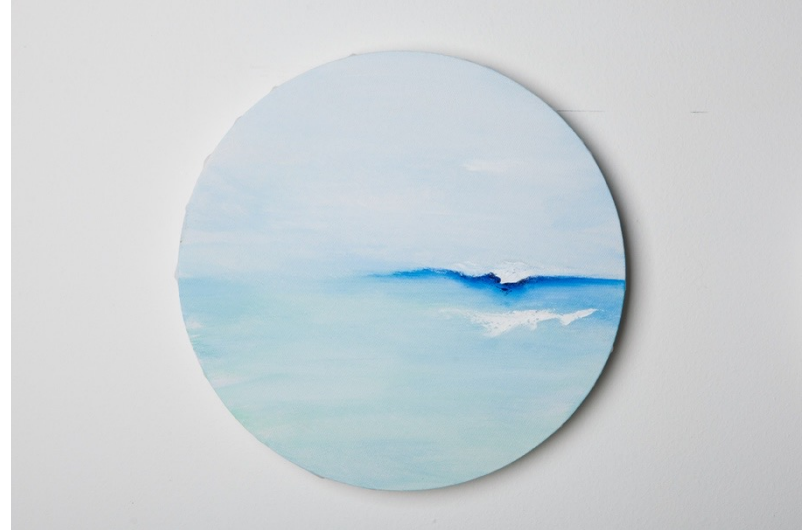
Yin Chua Calming waves 08 20cm Oil on canvas 2022 SGD 480