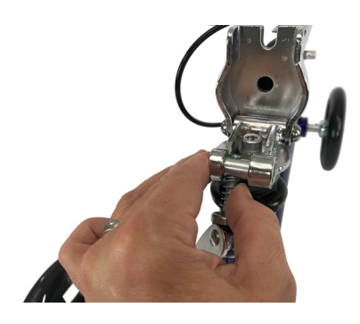
Push pin to the left

Raise the steering column up by pushing the clamp lever to the left allowing the column to raise all the way up (Top Left and Right). Raise the clamp lever upward in to the "U" slot and tighten by turning it clockwise (Bottom Left). Finally, push clamp lever down firmly to secure the steering column (Bottom Right). Reverse these steps when needing to lower steering column for transport.