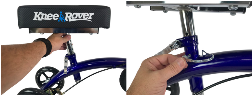
Insert Knee platform into the receptacle tube

The knee platform is designed to be used with either the right or left leg. Insert the knee platform post into the receptacle tube (Top Left). Next, set the knee platform at your desired height for use by inserting the locking pin through the aligned holes (Top Right). We recommend that the knee on the knee platform be at a 90 degree angle while the leg on the ground is straight. Finally, tighten the clamp lever to secure the knee platform in place (Bottom Left).