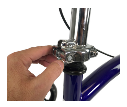
Raise steering column and release the pin