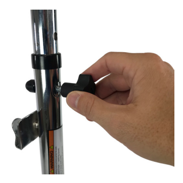
Step 5: Basket Assembly

Locate the basket bracket on the front of the steering column (Top Left). Place the rear basket holes over the bracket and push down (Top Right). Your basket is now installed on the steering column (Bottom).