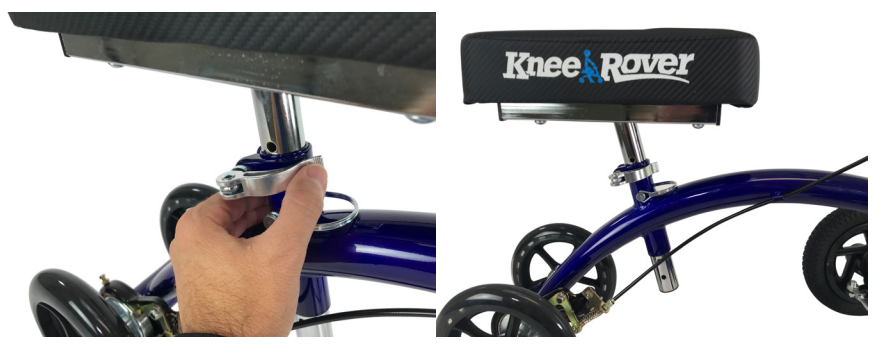
Tighten and secure the clamp