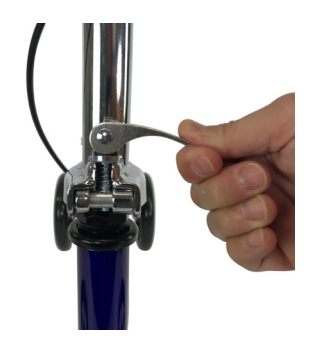
Push clamp down firmly

Raise the clamp into the "U" shaped slot