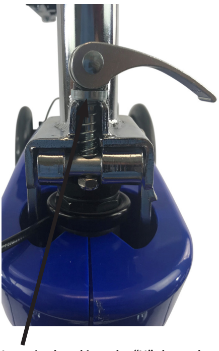
Lever is placed into the "U" slot and clamped down. Steering column is now secure.