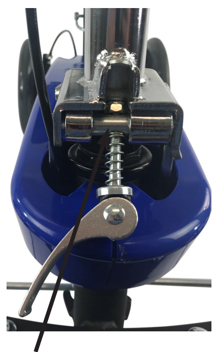
Spring loaded pin. Push to the left to release.

Raise the steering column up by pushing the clamp lever to the left allowing the column to raise all the way up (Left Photo). Raise the clamp lever upward in to the "U" slot and tighten by turning it clockwise (Right Photo). Finally, push clamp lever down firmly to secure the steering column. Reverse these steps when needing to lower steering column for transport.