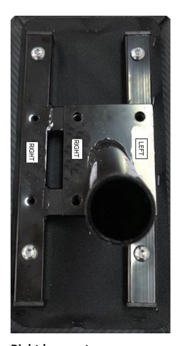
Right knee setup