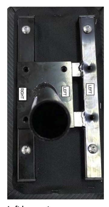
Left knee setup

The knee platform is designed to be used with the right or left leg. It is very important that the knee platform is set up for the proper leg as this offset is designed to help the rear wheels stay free from the pushing leg during use. If the left knee will be placed on the kneepad, position the kneepad post where the LEFT sticker on the post plate is showing next to the LEFT sticker on the kneepad frame (Left Photo). If the right knee will be placed on the kneepad, position the kneepad post where the RIGHT sticker on the post plate is showing next to the RIGHT sticker on the kneepad frame (Right Photo). Once set up properly, insert kneepad screws and tighten.