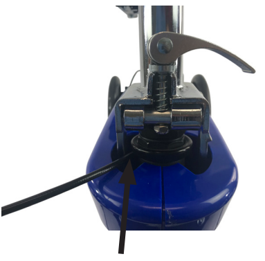
Make sure the brake cable is between the steering column and steering bracket.