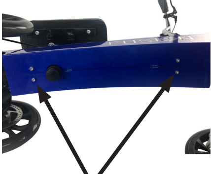
Install allen bolts with washers into the mounting.