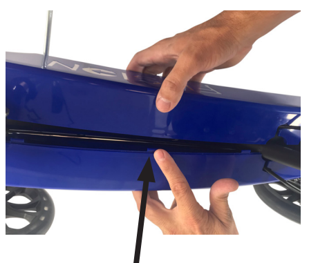
Snap the cover together at all tab points.