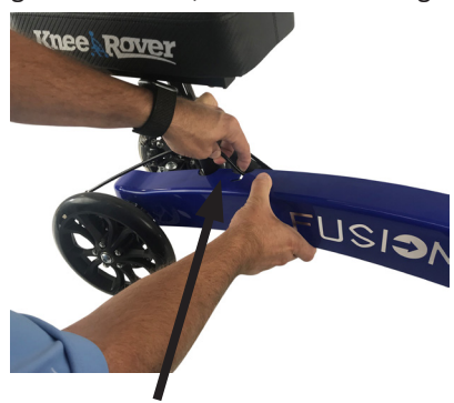
Place brake cable through slot.

Tighten the bolts, but do not over tighten.