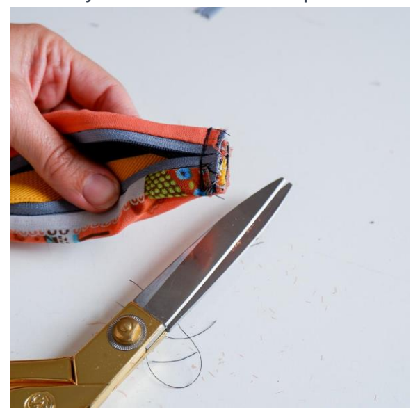
Step 5: Adding the Finishing Touches

If you're having difficulty sewing over this thick pack, be sure to use a thick needle (size 80 or more) and a <u>bulky seam jumper</u> to tilt your presser foot to the necessary level. Trim any excess fabric and clip the corners for neatness.