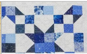
ROAD TO OKLAHOMA