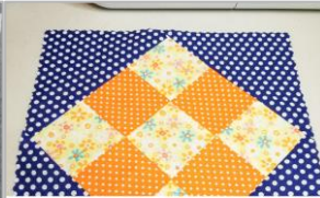
CROSSROAD TO JERICHO