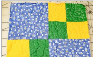
DOUBLE FOUR PATCH SQUARE