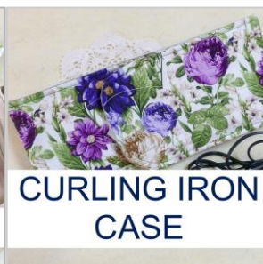
CURLING IRON CASE