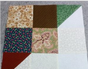
LIGHT & DARK