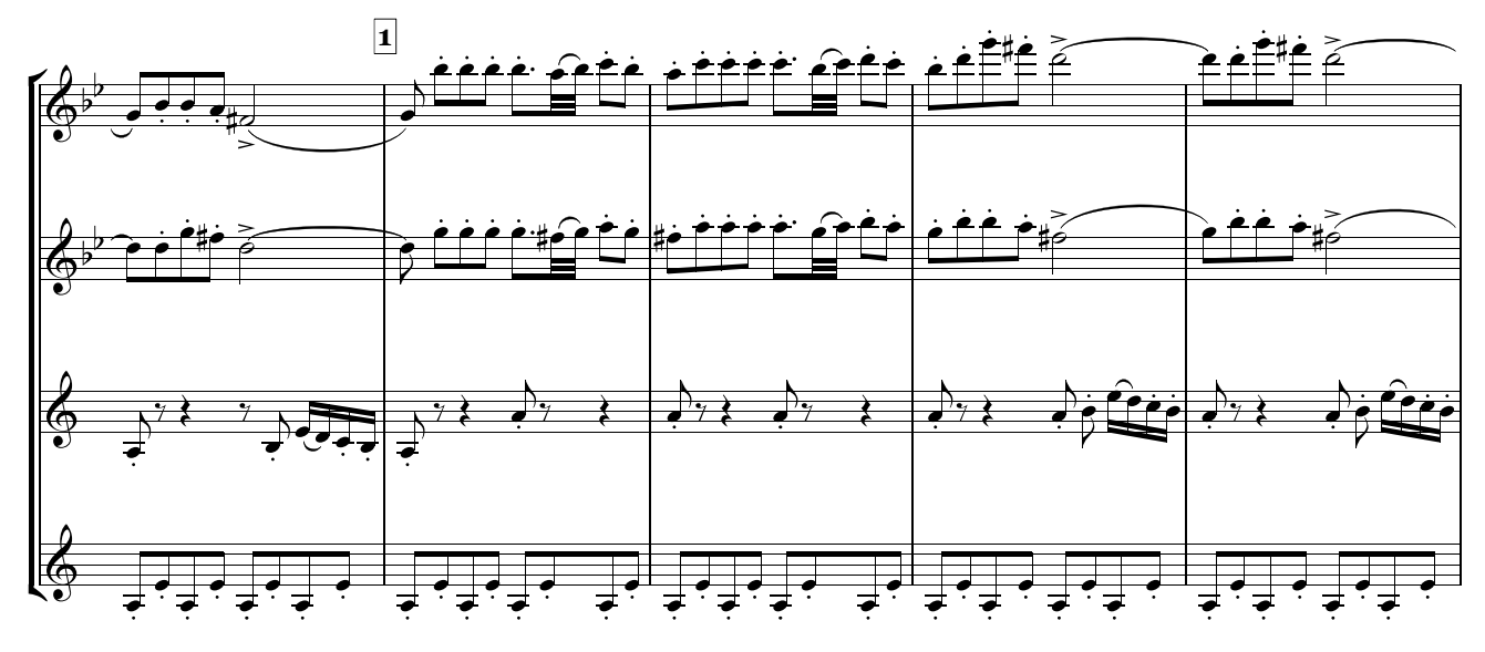
\begin{array}{c} \mbox{Copyright} @ \mbox{2019} by \mbox{Whichpond Music} (ASCAP) - www.whichpond.com \\ \mbox{All Rights Reserved}. \end{array}