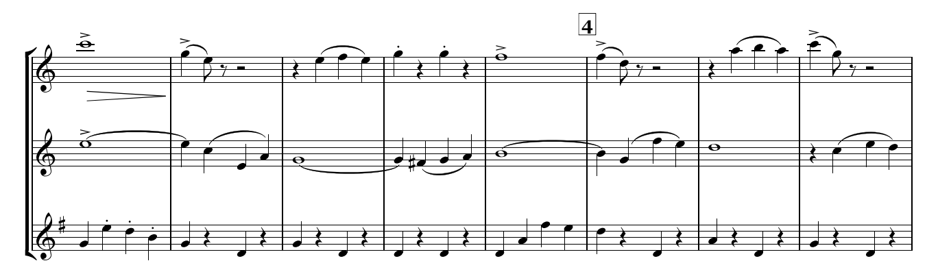
Copyright \odot 2018 by Whichpond Music (ASCAP) - www.whichpond.com All Rights Reserved.