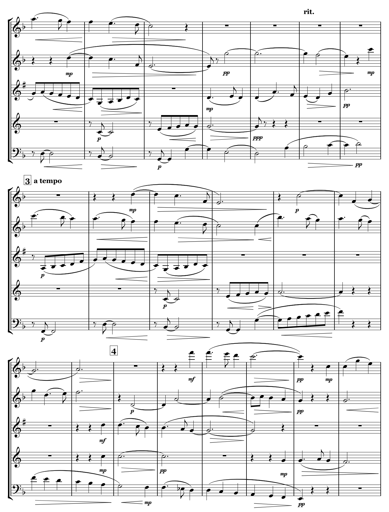
2183 - Away in a Manger