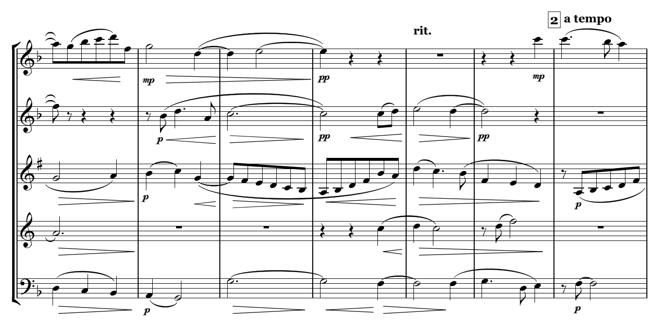
Copyright @ 2018 by Whichpond Music (ASCAP) - www.whichpond.com All Rights Reserved.