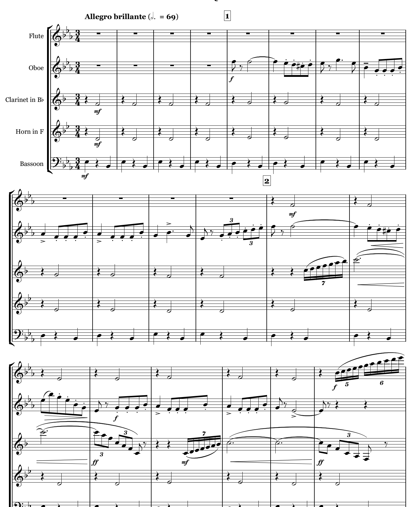
from The Nutcracker for Wind Quintet