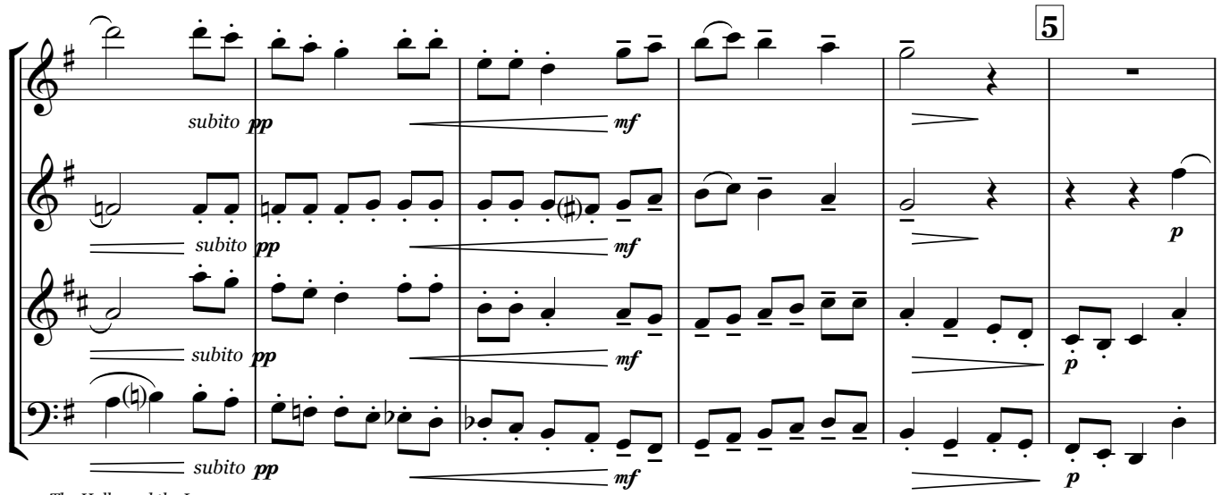
2050 - The Holly and the Ivy