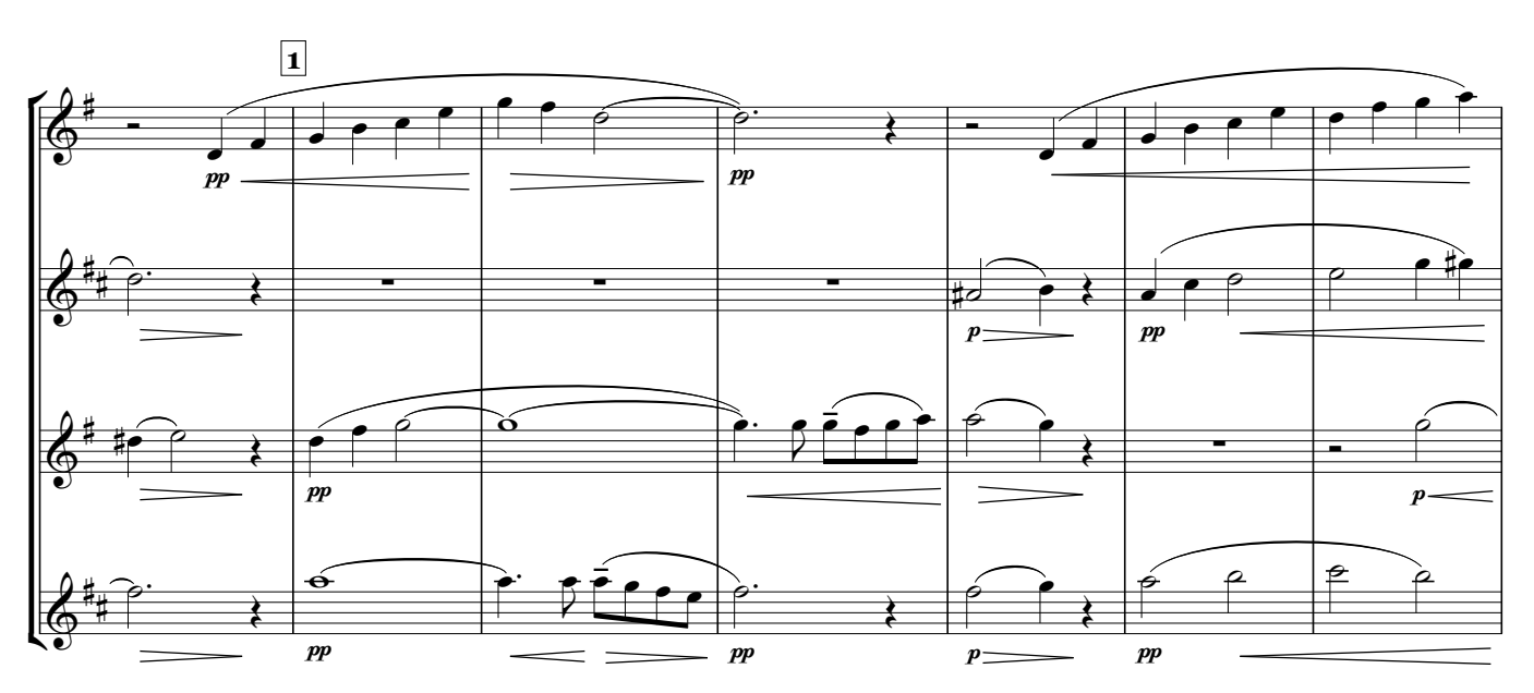
Copyright @ 2015 by Whichpond Music (ASCAP) - www.whichpond.com All Rights Reserved.