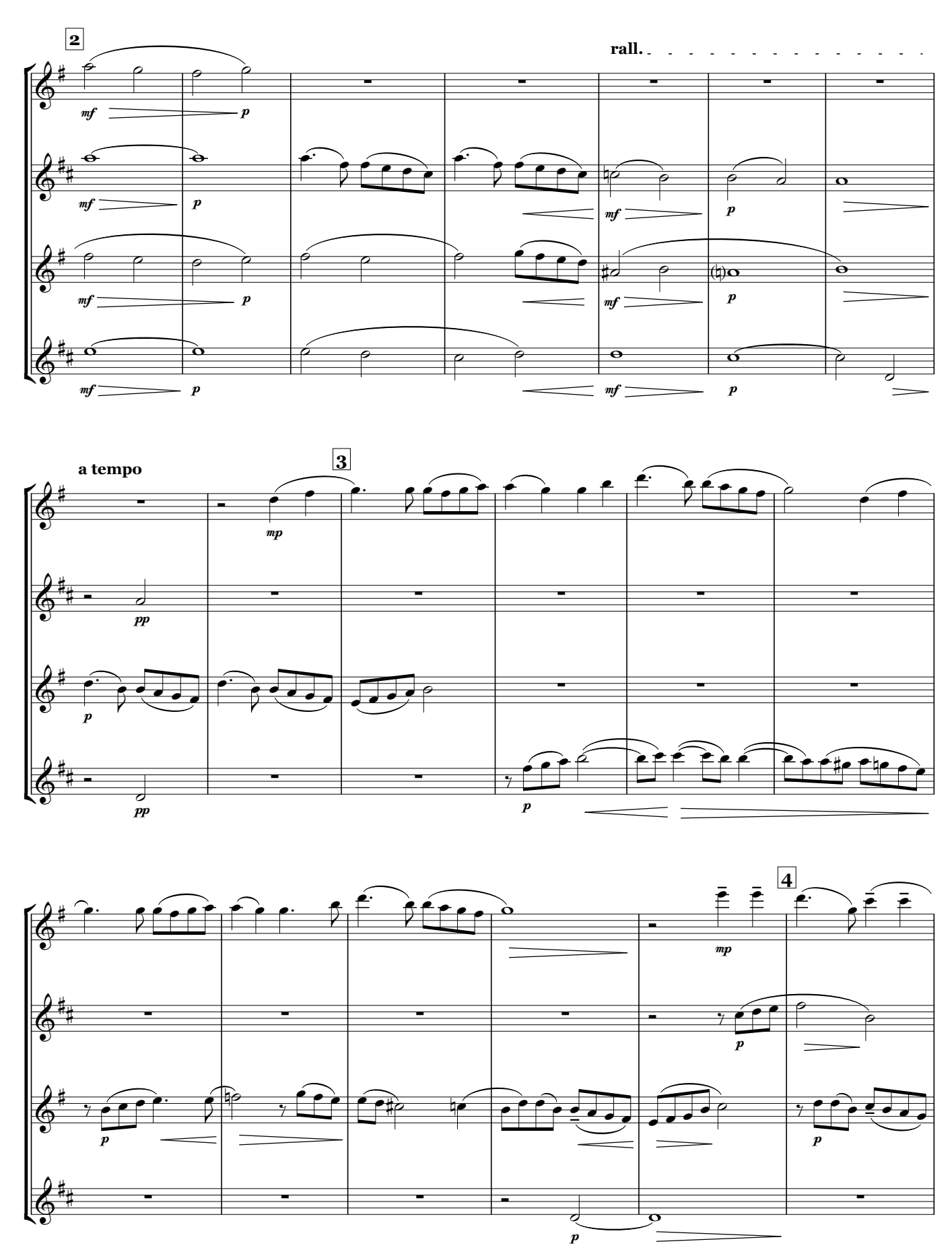
1844 - Once in Royal David's City