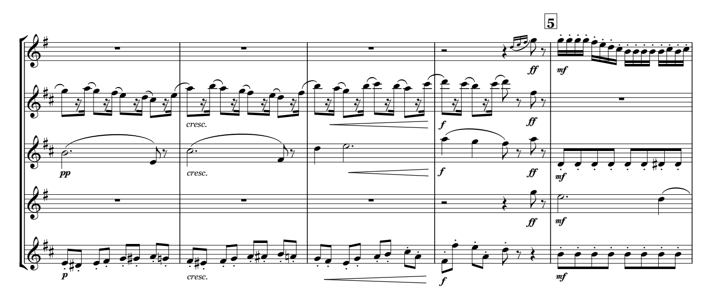
1839 - Nutcracker\ March