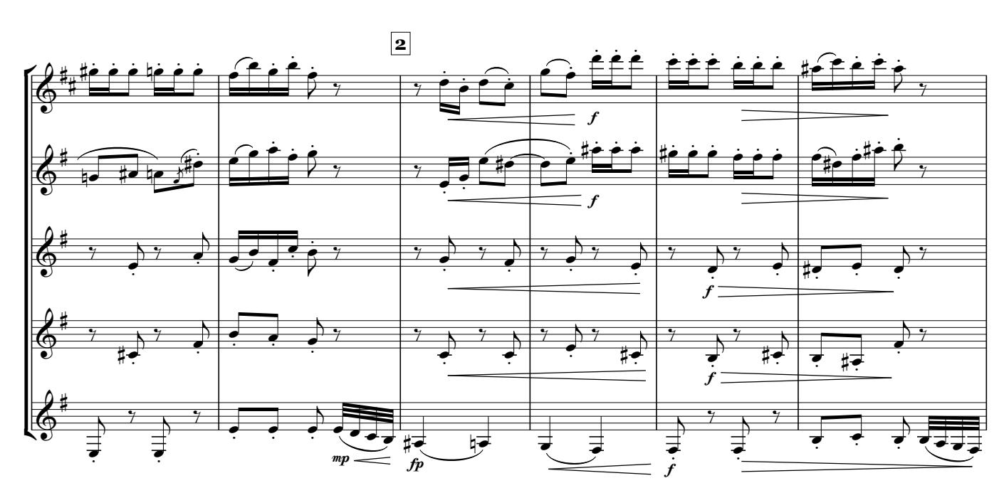
Copyright @ 2015 by Whichpond Music (ASCAP) - www.whichpond.com All Rights Reserved.