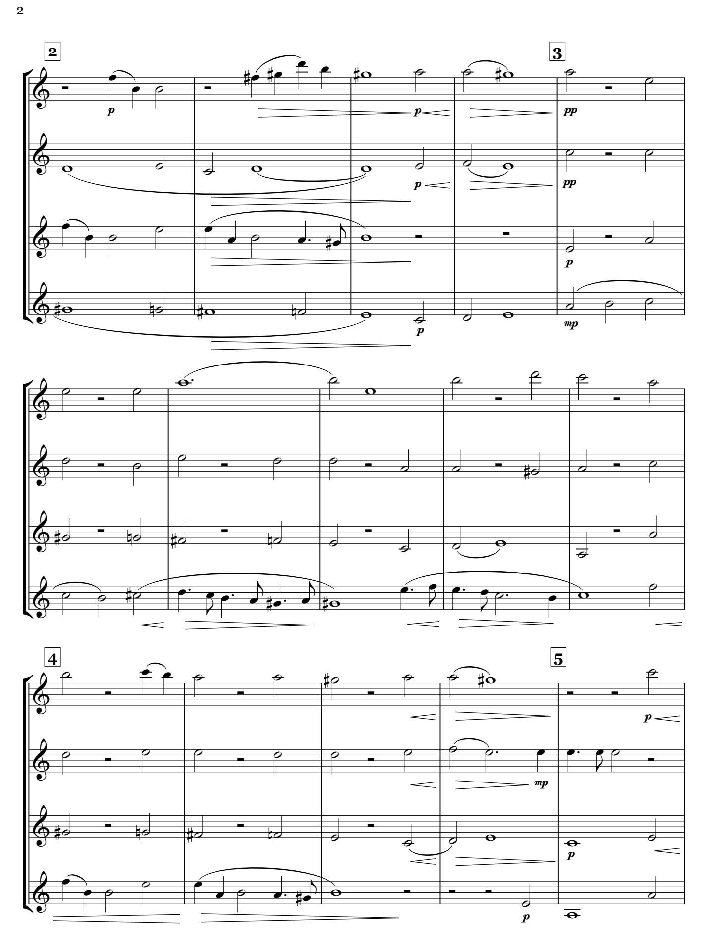
1696 - Dido's Lament