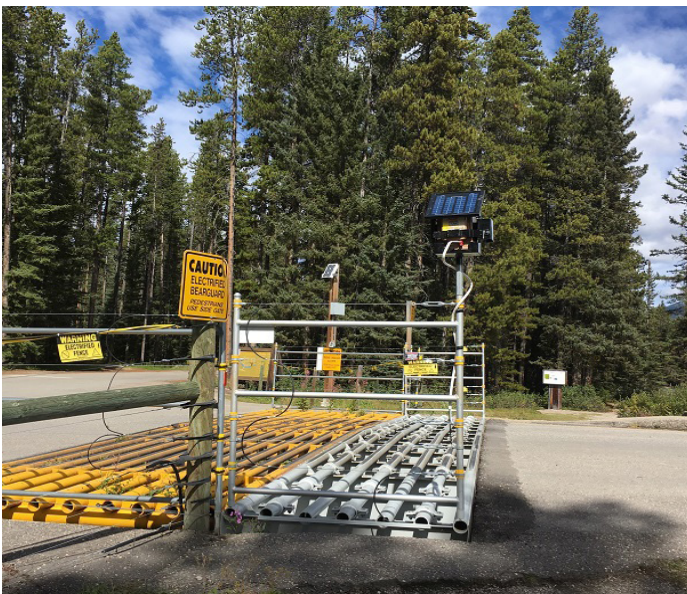
Figure 6. Electrified cattle guard at Lake Louise campground.