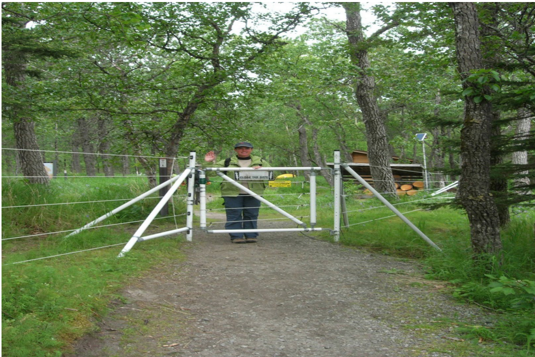
Figure 4. H. Davis stands behind the electrified gate at Brooks Camp campground.

Several different designs can be used for gates to access electric fenced enclosures. Panels or grids of electric wires in the same array as the fence (either positive/hot wires or alternating positive/negative) can be placed on the outside of the gate in series with one connecting wire on a spring-loaded insulated handle to the electrified fence (Figure 4, 5) or for larger set-ups, such as campgrounds or landfills, a larger panelled gate or an electrified drive-over cattleguard/Texas Gate (e.g., used at Lake Louise Campground Figure 6; Parks Canada 2012) or electrified mats can be used to deter wildlife crossing where wildlife fences meet roadways. Electrified road crossing structures should be \geq 3.6 m deep to prevent animals jumping over them (J. Marley, pers. comm. 2017).