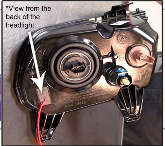
*View from the back of the headlight.