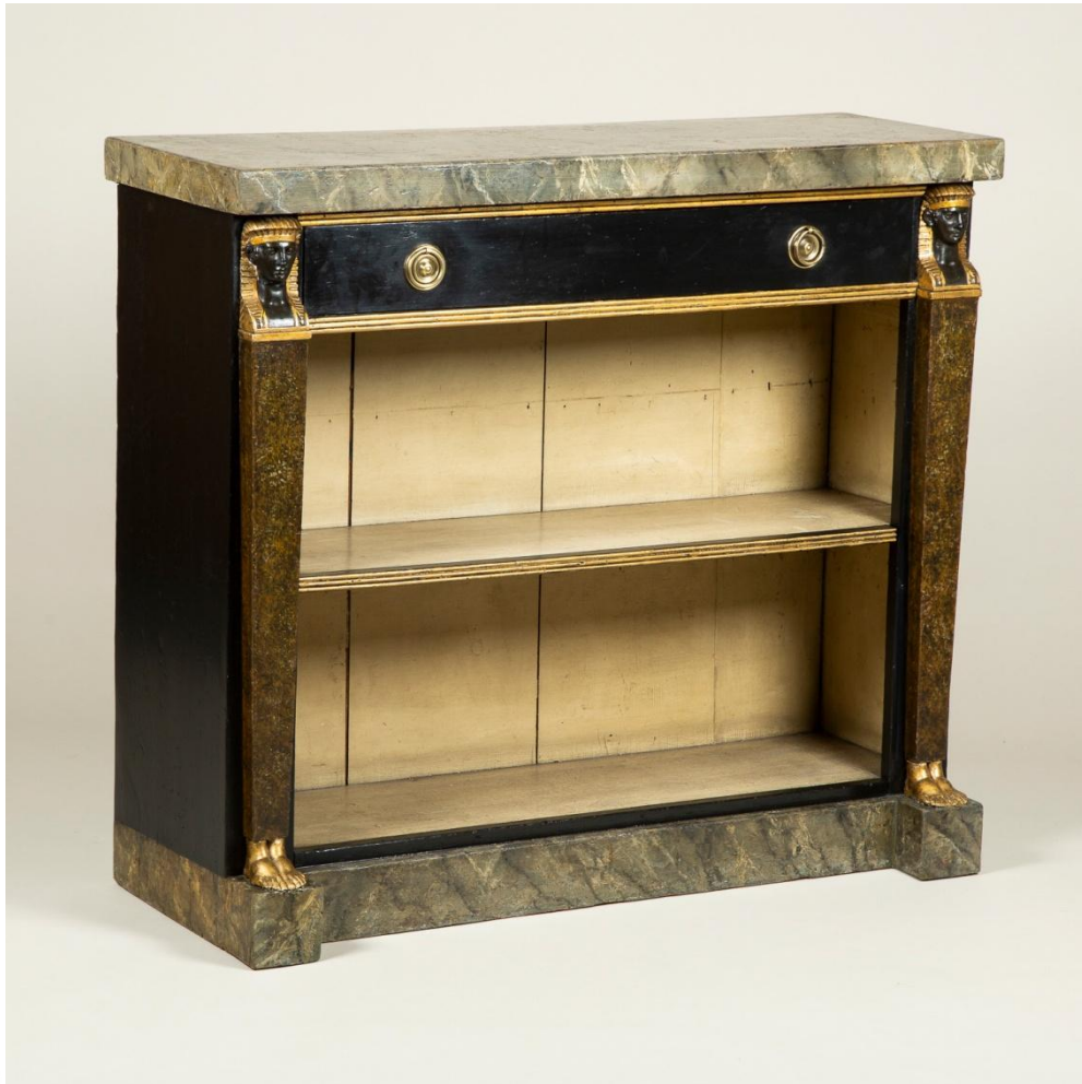
A pair of low painted bookcases, each with a faux marble top over a drawer with open shelves flanked by Egyptian headed herms on a plinth base. English, 19 th century. (Of slightly differing widths).

INTERIOR DESIGN, DECORATION AND ANTIQUES