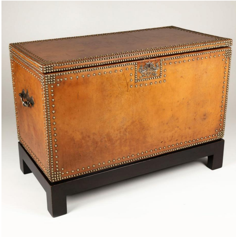
A rectangular trunk covered with tan leather and decorative brass nailing and marquetry, lined lid. 18 th century with later stand.

INTERIOR DESIGN, DECORATION AND ANTIQUES