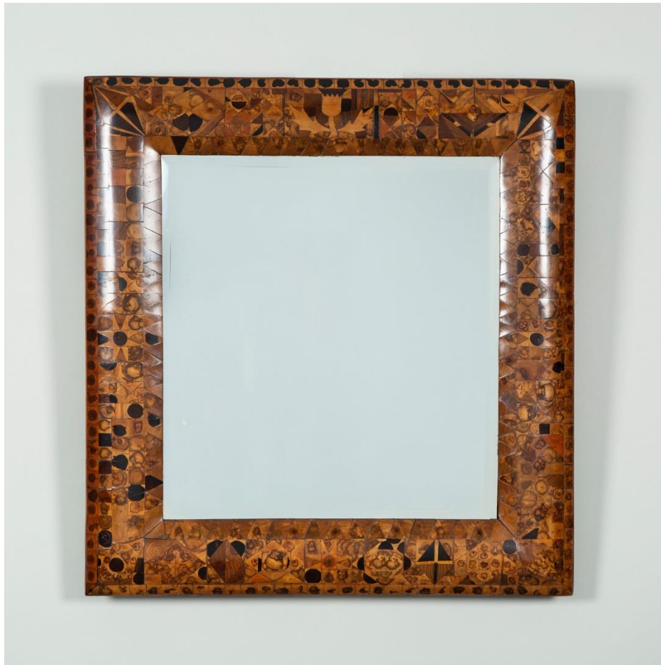
A small rectangular mirror with an intricate burr wood marquetry cushion frame and bevelled plate. 19 th C.

INTERIOR DESIGN, DECORATION AND ANTIQUES