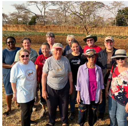
2024 Trip to Zambia, including airfare, lodging, meals (Value $4500) 2