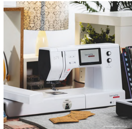
bernette 79 Combination Sewing / Embroidery Machine (SRP $2935) 1