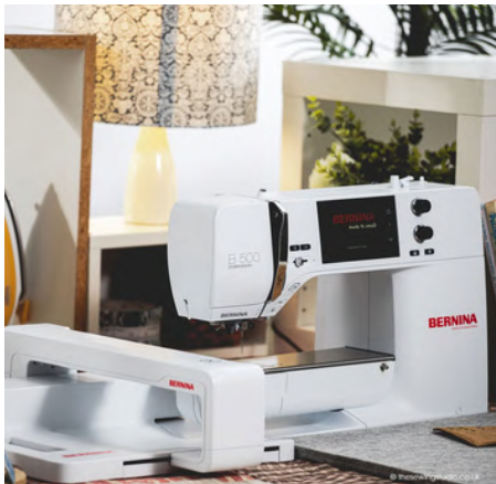
Bernina 500E Embroidery Machine (SRP $4899) 1