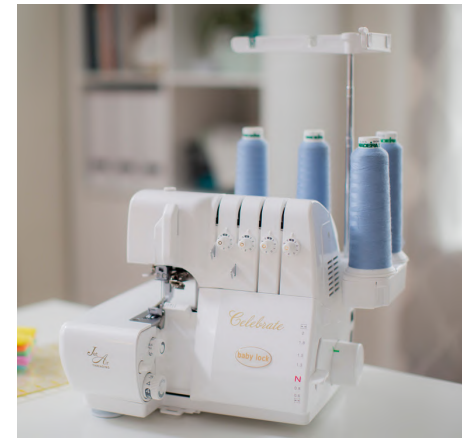
Baby Lock Celebrate Serger (SRP $2499)